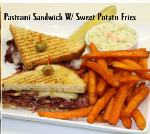
Pastrami Sandwich W/ Sweet Potato Fries