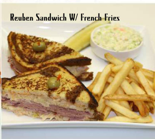
Reuben Sandwich W/ French Fries