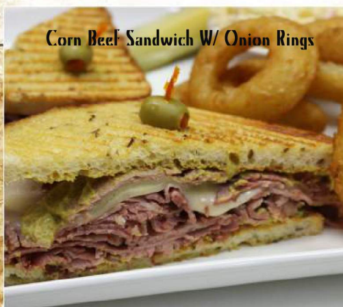
Corn Beef Sandwich W/ Onion Rings